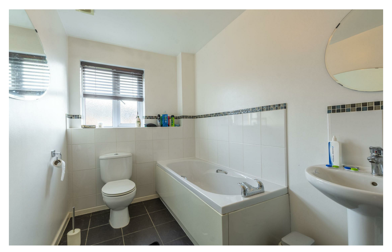
A WELL PRESENTED TWO DOUBLE BEDROOM FIRST FLOOR APARTMENT BEING SOLD WITH THE BENEFIT OF NO UPWARD CHAIN.

Robert Ellis are delighted to bring to the market a property that was constructed in 2007 and offers light and airy accommodation that would suit the first time buyer or buy to let investor. With electric heating the property is found in a block of similar size apartments and benefits from having its own allocated parking space to the rear. The property can be accessed from the front or rear elevation with a well maintained communal hallway. An early internal viewing is highly recommended to fully appreciate the accommodation on offer.